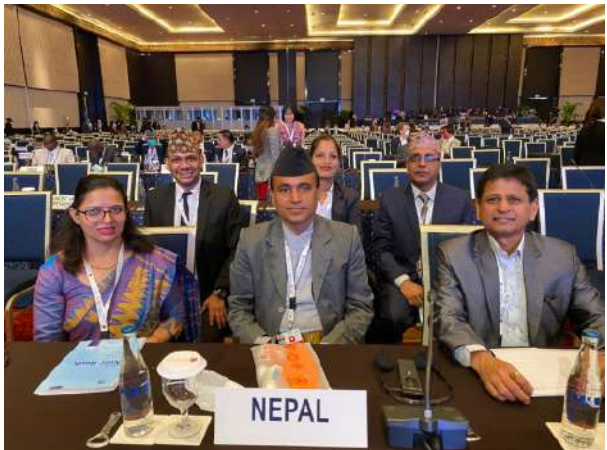
The seventh session of Global Platform for Disaster Risk Reduction(GPDRR)- 2022 was organized by the UN Office for Disaster Risk Reduction (UNDRR) from 23rd to 28th May,

2022 in Bali, Indonesia. The platform was hosted by the Government of Indonesia. The participants from different parts of the world participated in the event.